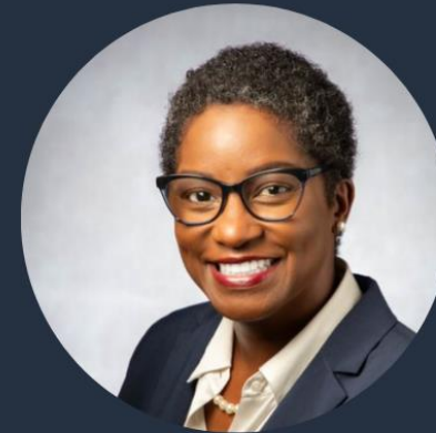
Tomika Monterville City of San Antonio Bike Master Plan