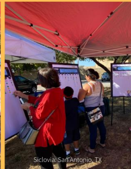
Siclovía: San Antonio, TX