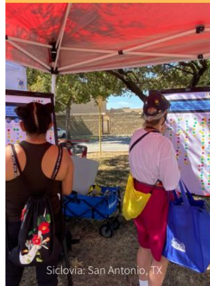
Siclovía: San Antonio, TX