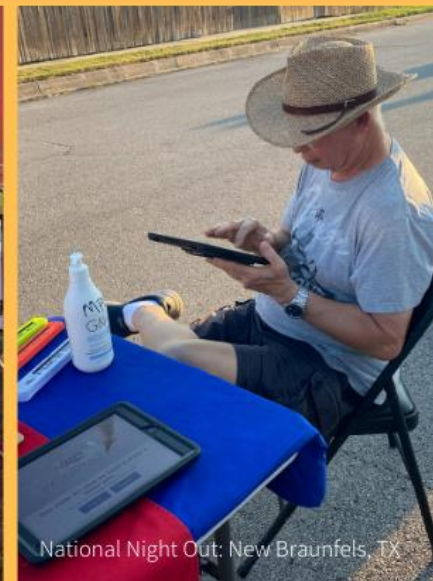
National Night Out: New Braunfels, TX